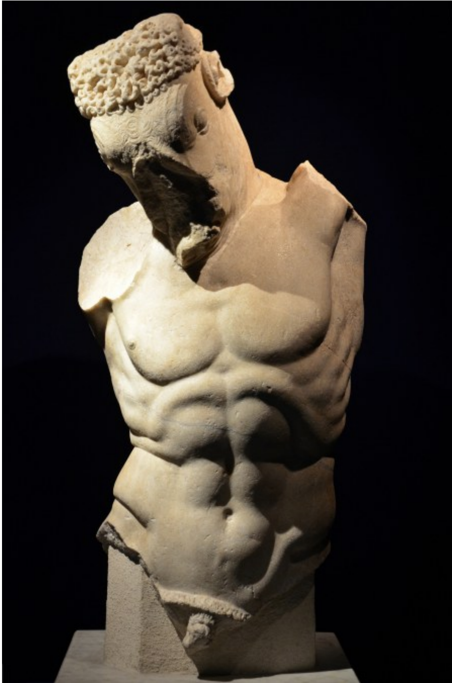
Marble statue of a Minotaur, part of a group with Theseus, 1st century AD, found in Rome in Via San Tommaso in Parione in 1895, Monsters. Fantastic Creatures of Fear and Myth Exhibition, Palazzo Massimo, Rome