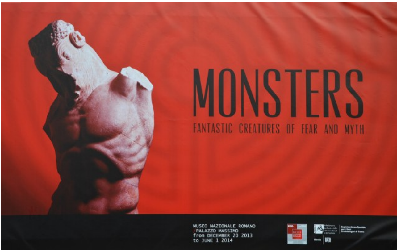
Monsters. Fantastic Creatures of Fear and Myth Exhibition, Palazzo Massimo, Rome

The Roman National Museum at Palazzo Massimo is hosting a superb and original exhibition called “Mostri, creature fantastiche della paura e del mito” (Monsters, fantastic creatures of fear and myth). The show brings together over 100 works from 40 museums, depicting fantastical creatures, all in a series of dark passages intended to resemble the Minotaur’s labyrinth.