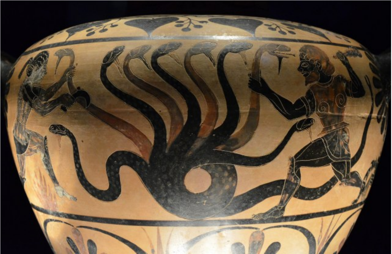
Hydria (ceramic water container) with Heracles and the Lernaean Hydra (an ancient serpent-like water monster), from Etruria, attributed to the Painter of Aquila, 530-500 BC, Monsters.

Fantastic Creatures of Fear and Myth Exhibition, Palazzo Massimo, Rome