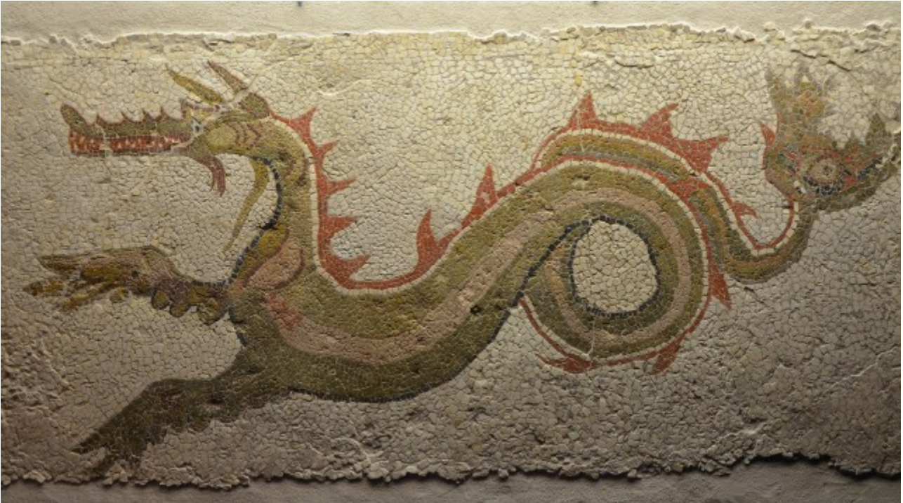
Mosaic with a ketos (sea monster) found at Caulonia (Monasterace) in the Casa del Drago, 3rd century BC, Monsters. Fantastic Creatures of Fear and Myth Exhibition, Palazzo Massimo, Rome