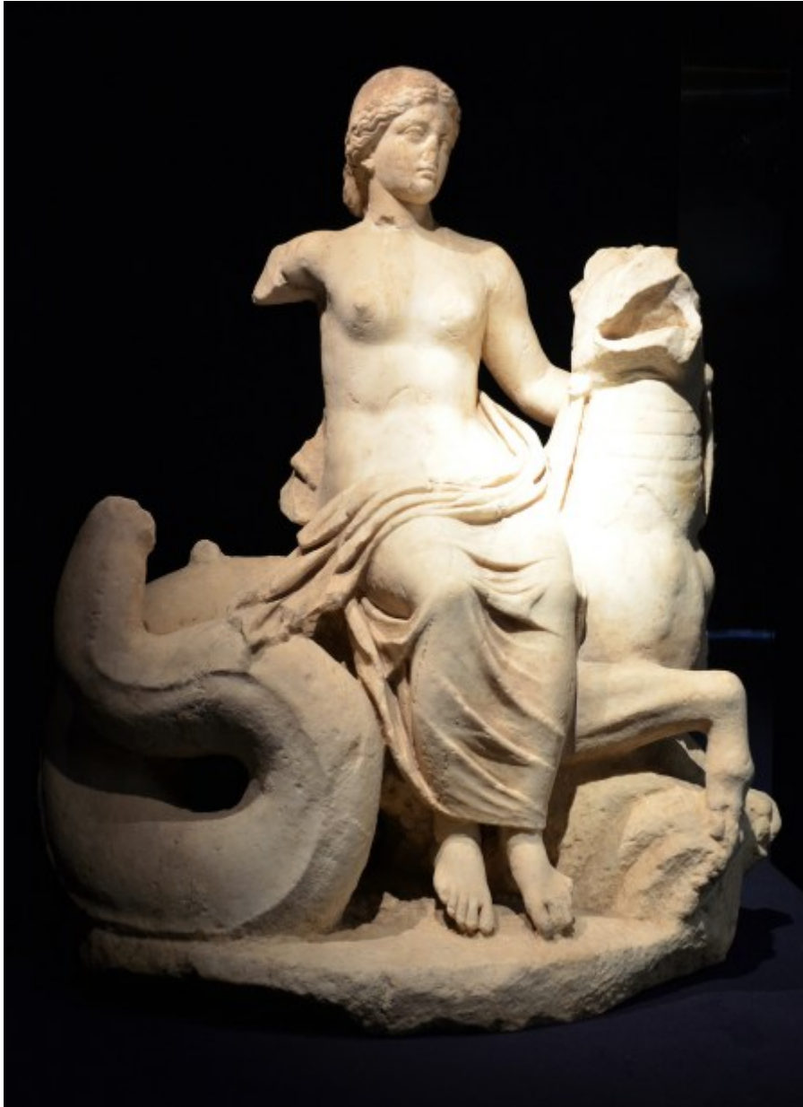
Marble group of a Nereid on a sea monster, from Rome, 1st century BC, Monsters. Fantastic Creatures of Fear and Myth Exhibition, Palazzo Massimo, Rome