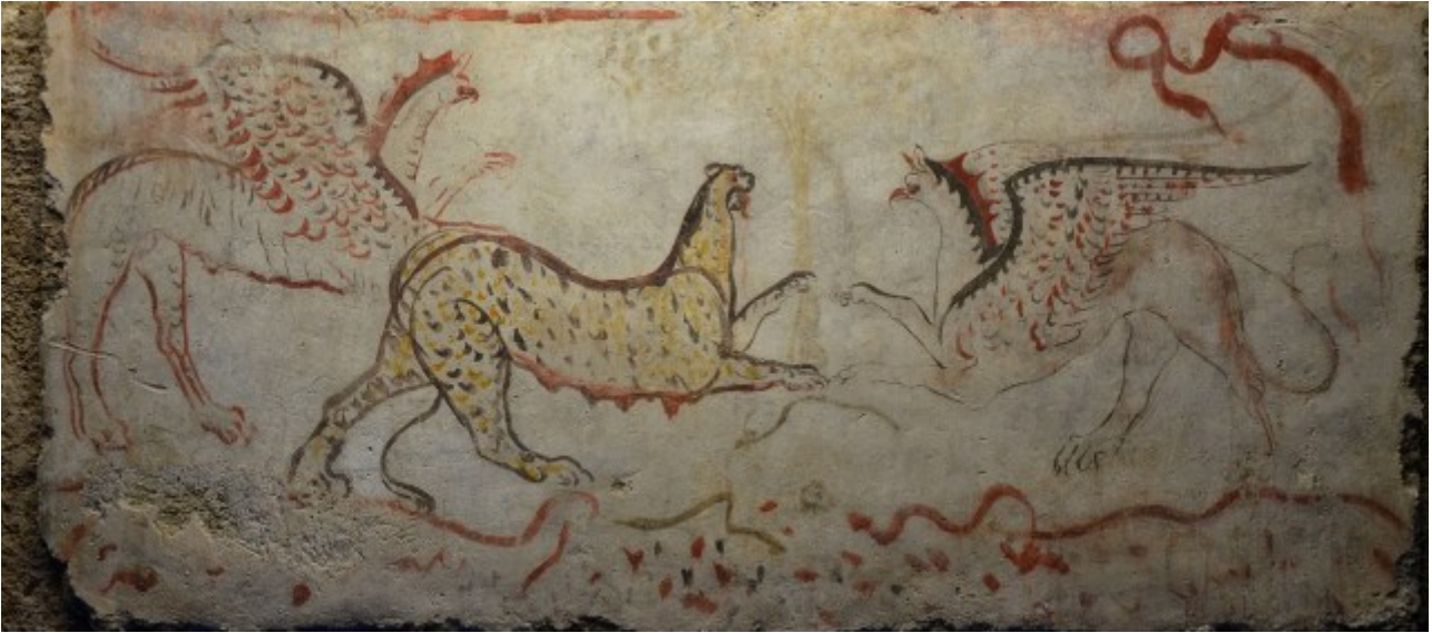
Painted travertine slab showing two griffins attacking a panther, 340 BC, found in tomb 58 at Andriuolo, Paestum, Monsters. Fantastic Creatures of Fear and Myth Exhibition, Palazzo