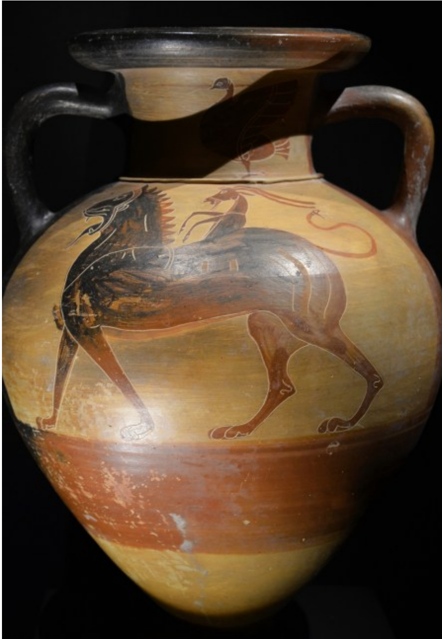
Black figure amphora showing a Chimera, 550-525 BC, Tolfa Group from southern Etruria, Monsters. Fantastic Creatures of Fear and Myth Exhibition, Palazzo Massimo, Rome