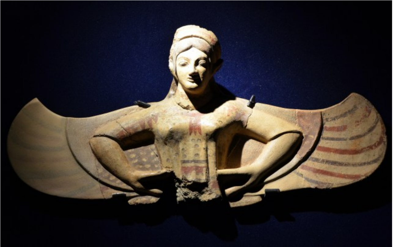
Terracotta acroterial statue of a Harpy/Siren, from Gabii, end of 6th century BC - beginning 5th century BC, Monsters. Fantastic Creatures of Fear and Myth Exhibition, Palazzo Massimo, Rome