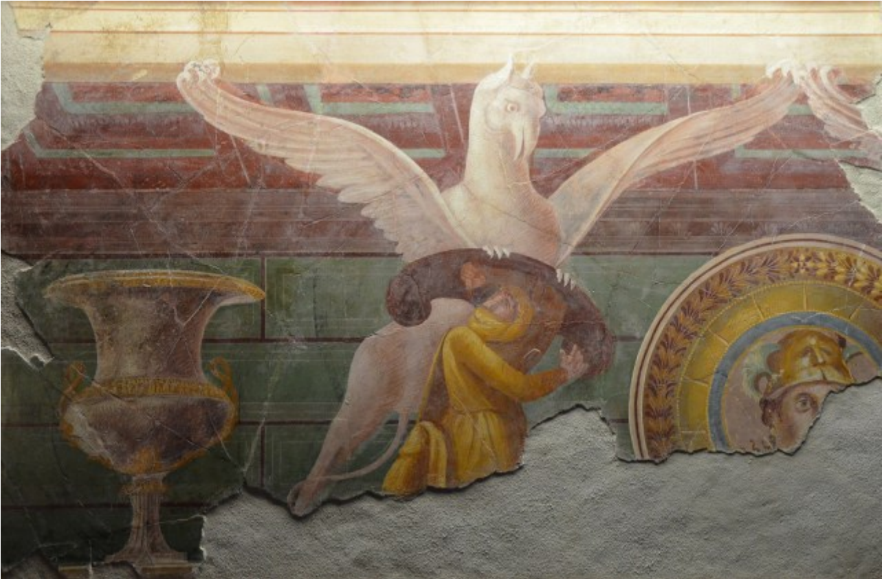
Fresco depicting a griffin attacking one of the Arimaspi (legendary Scythian), from the Villa of the Mysteries in Pompeii, 1st century BC, Monsters. Fantastic Creatures of Fear and Myth Exhibition, Palazzo Massimo, Rome