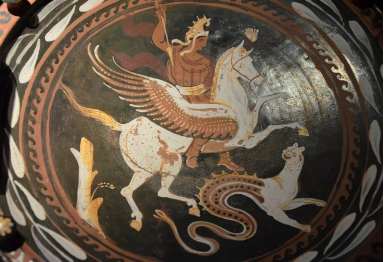
Red-figure plate showing Bellerophon riding Pegasus and a Chimera, by the Baltimore painter, second half of the 4th century BC, Monsters. Fantastic Creatures of Fear and Myth Exhibition, Palazzo Massimo, Rome