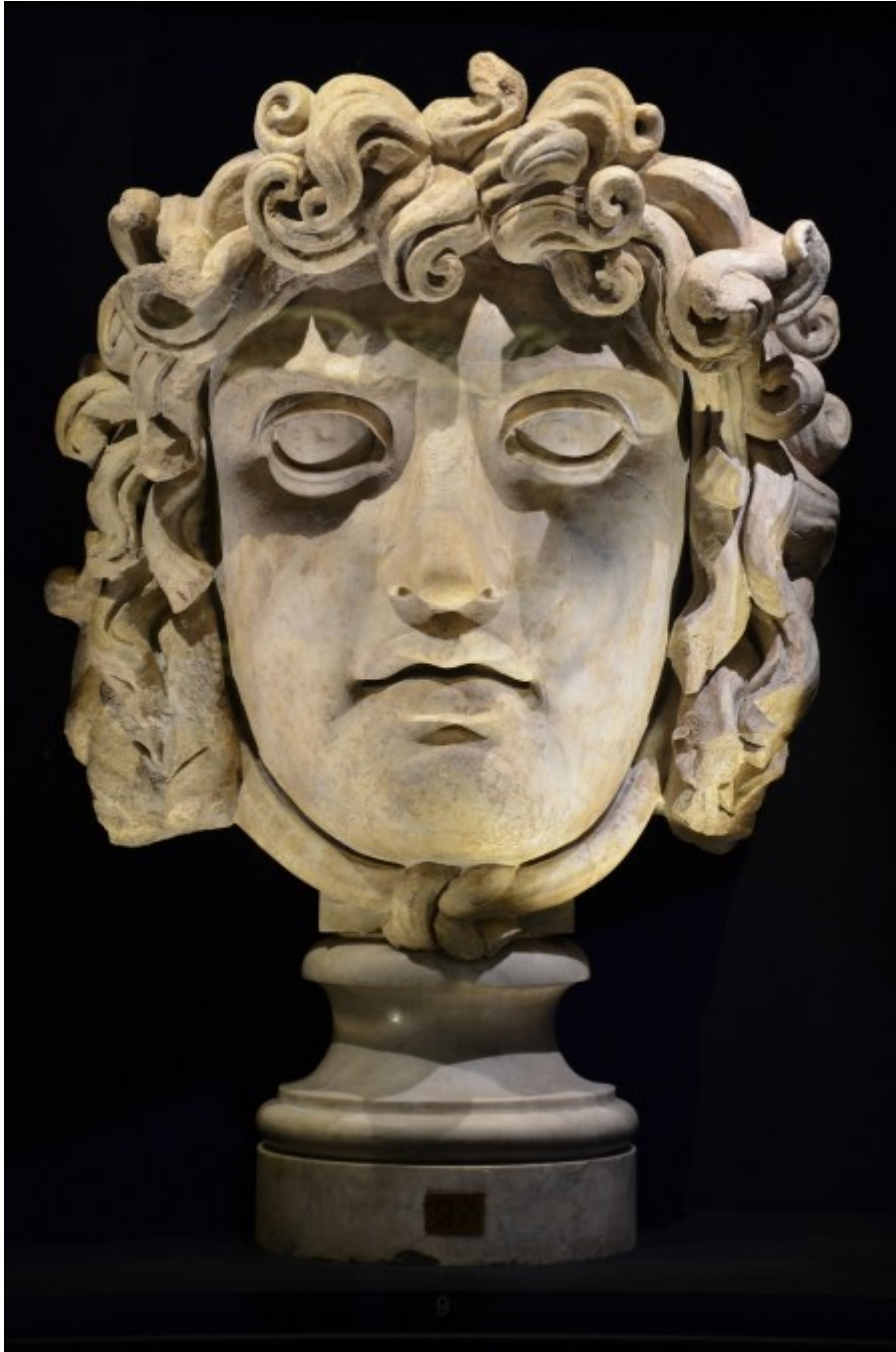
Gorgon's head, from the Temple of Venus and Roma in Rome, 2nd century AD, Monsters. Fantastic Creatures of Fear and Myth Exhibition, Palazzo Massimo, Rome