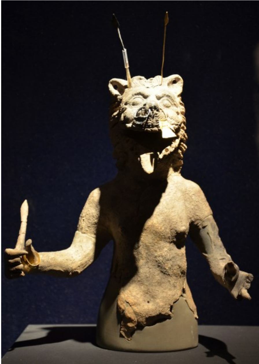
Terracotta statue of lion-headed man with gold and silver insets, 6th-5th century BC, from Tharros, Sardinia, Monsters. Fantastic Creatures of Fear and Myth Exhibition, Palazzo Massimo, Rome