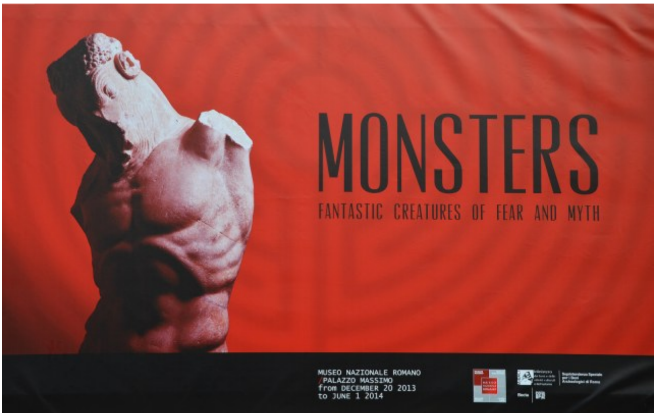
Monsters. Fantastic Creatures of Fear and Myth Exhibition, Palazzo Massimo, Rome

The Roman National Museum at Palazzo Massimo is hosting a superb and original exhibition called “Mostri, creature fantastiche della paura e del mito” (Monsters, fantastic creatures of fear and myth). The show brings together over 100 works from 40 museums, depicting fantastical creatures, all in a series of dark passages intended to resemble the Minotaur’s labyrinth.