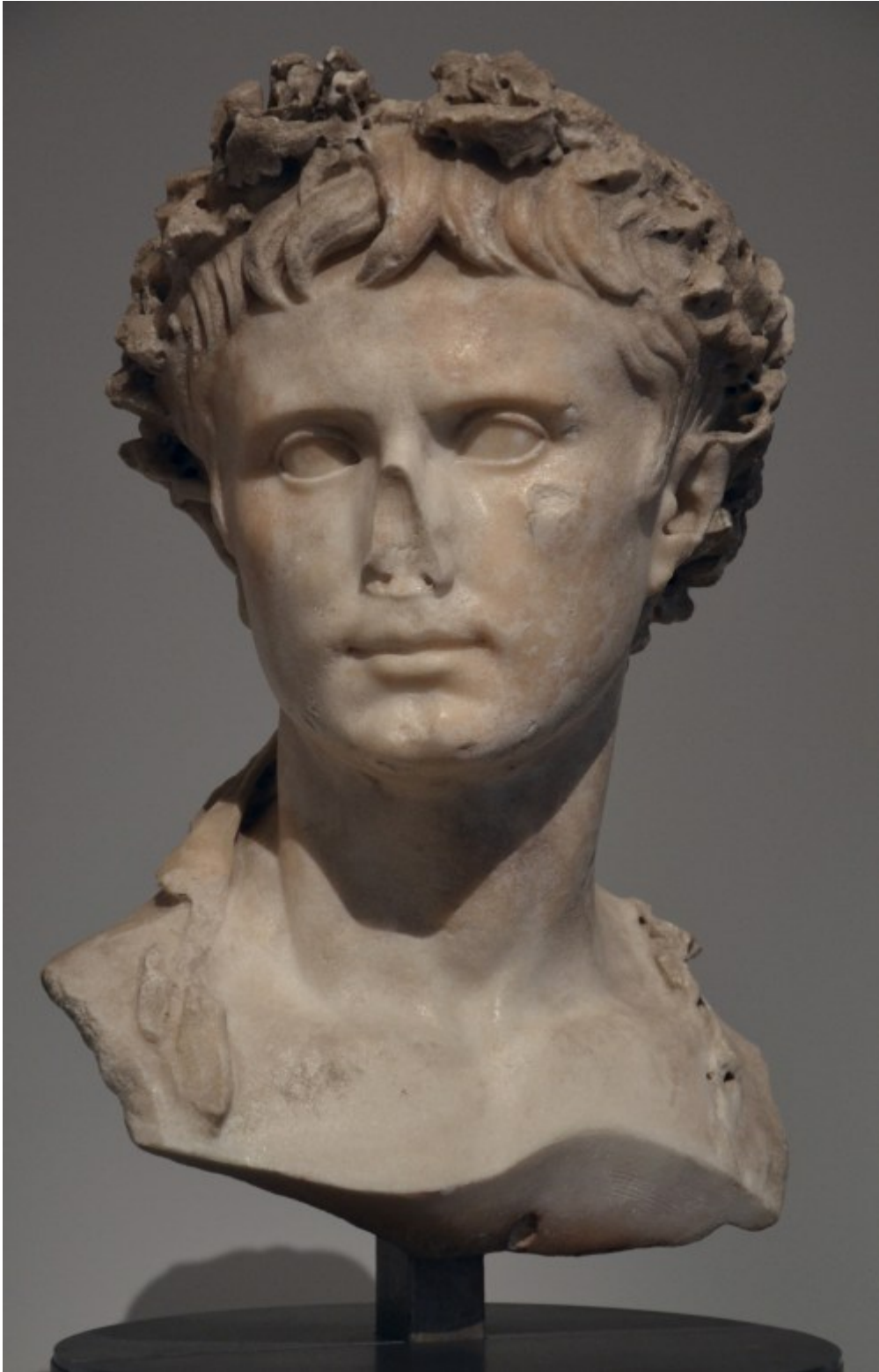
Bust of August wearing the oak crown discovered on the site of the