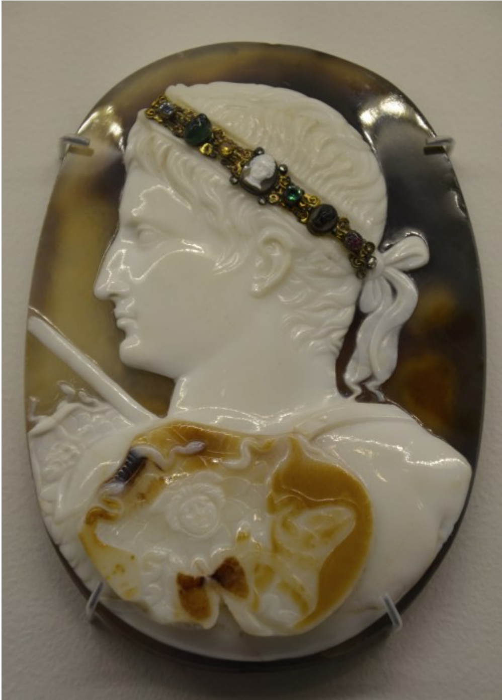
Cameo portrait of Augustus, about AD 14-20