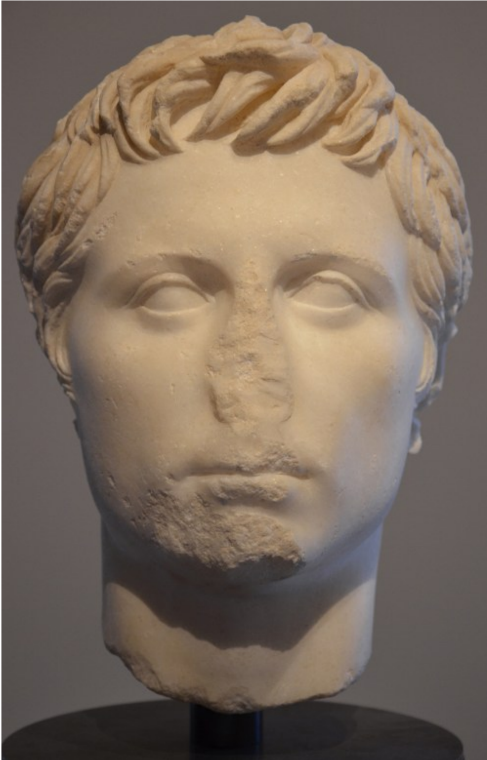
Head of Octavian, dating to the Triumvirate at the time of the Battle of