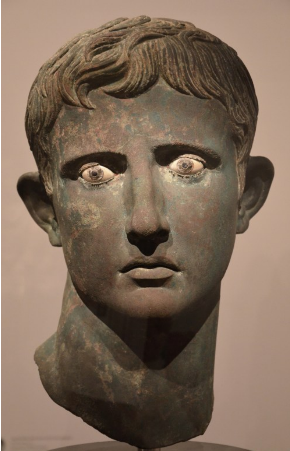
Bronze head from an over-life-sized statue of Augustus, found in the