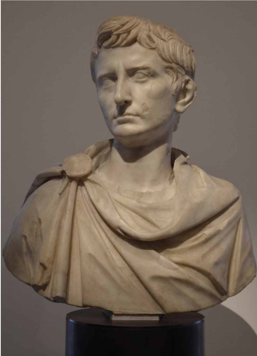
Bust of Octavian, probably created ca. BC 31 after his victory at the Battle of Actium