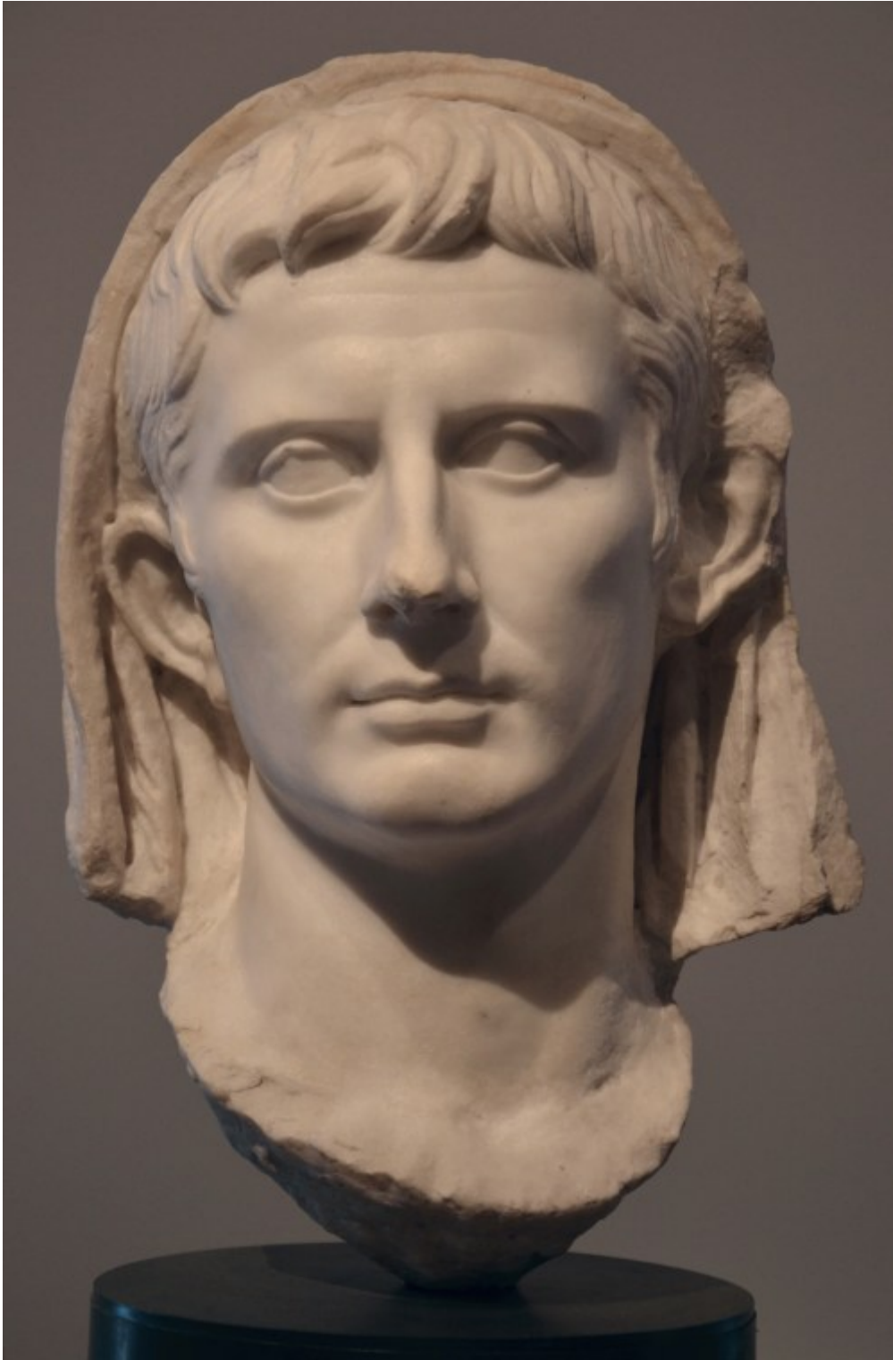
Veiled head of Augustus, end of 1st century BC