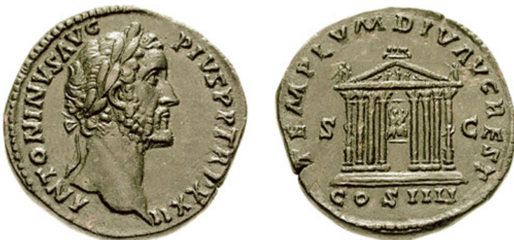
Temple of Divus Augustus on a coin of Antoninus Pius issued circa AD 158

Antoninus Pius, who was perhaps motivated by a desire to be publicly associated with the first emperor, restored the Temple of Divus Augustus built to commemorate the deified first Augustus. The restored temple was shown on coins which depict it with an octostyle design with Corinthian capitals and two statues - presumably of Augustus and Livia - in the cella. The pediment displayed a relief featuring Augustus and was topped by a quadriga.