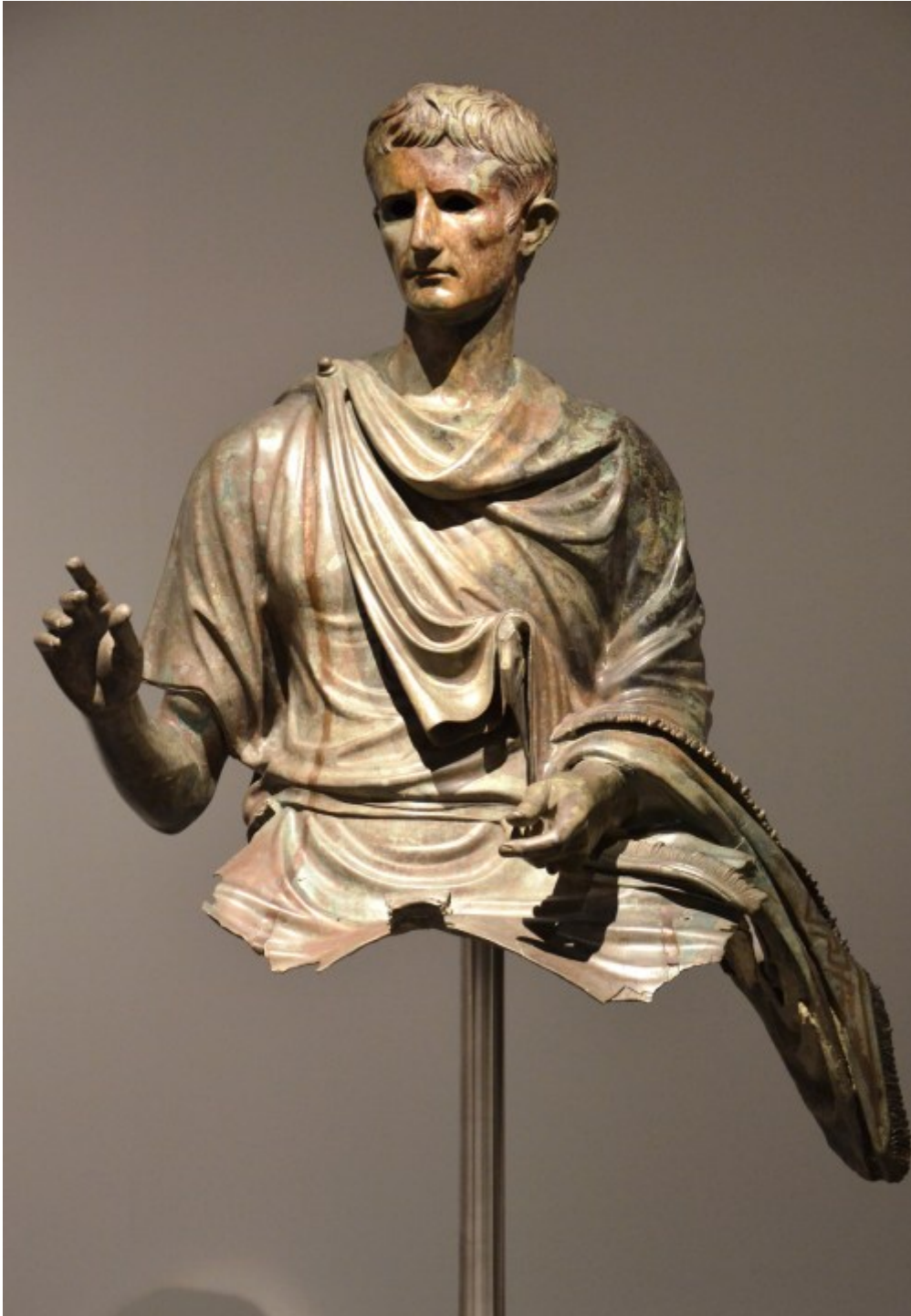
Bronze torso from an equestrian statue of Augustus dating from the end of the 1st century BC