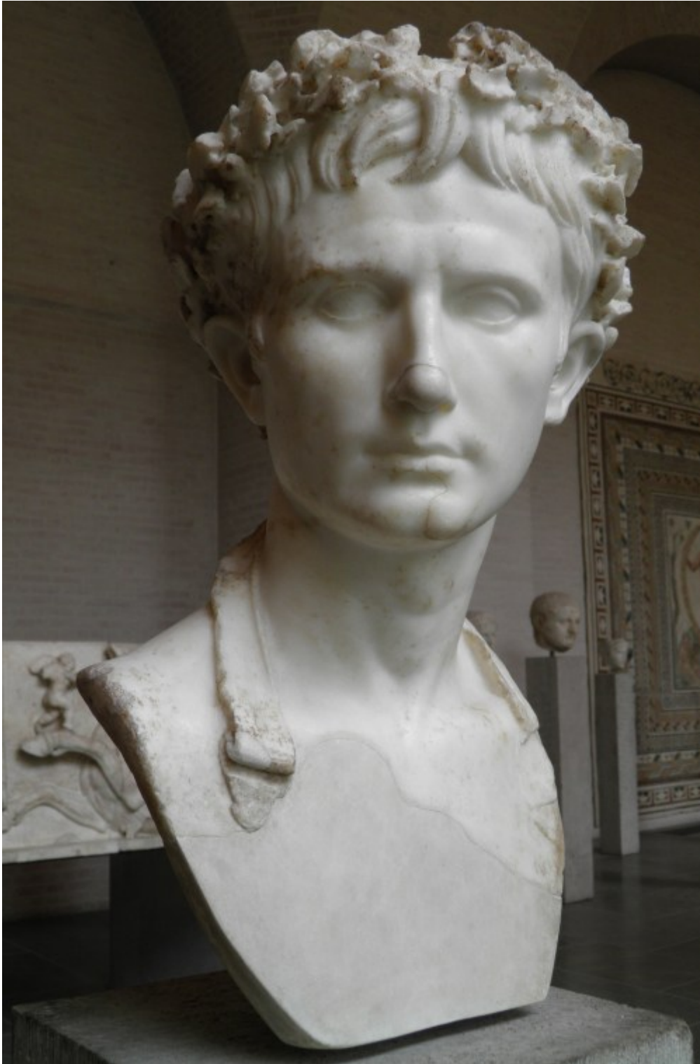
The so called "Augustus Bevilacqua", bust of the emperor Augustus wearing the Corona Civica