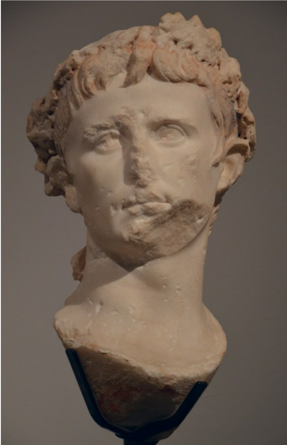
Posthumous portrait of Augustus, discovered in Saintes (France), ca. AD