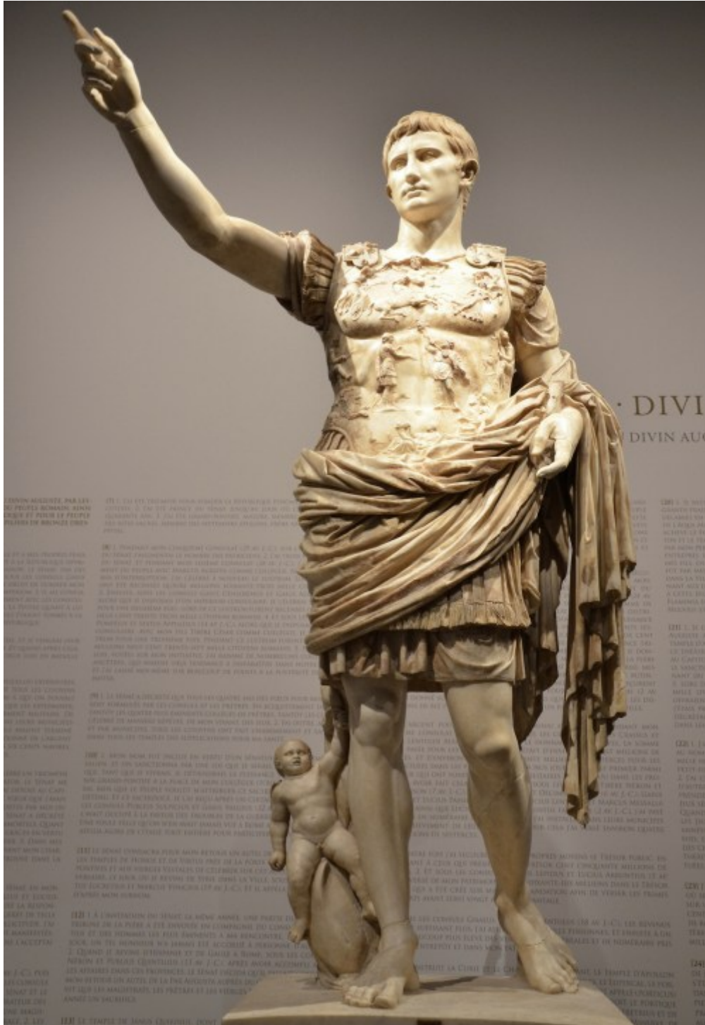
Augustus of Prima Porta, discovered in the Villa of Livia at Prima Porta