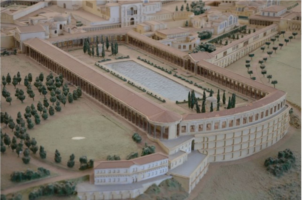
Model of Hadrian's Villa showing the Pecile

In addition to the statue from Hadrian's Villa, other Roman copies remain. The most famous copy is the one in the Staatliche Museum in Berlin known as the 'Berlin Dancer'. Another example is in the Liebieghaus in Frankfurt.