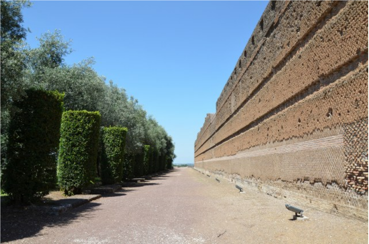
The long wall of the porticus of the Pecile, Hadrian's Villa, Tivoli

garden with a long covered walkway delimiting a garden with a large pool in its centre.