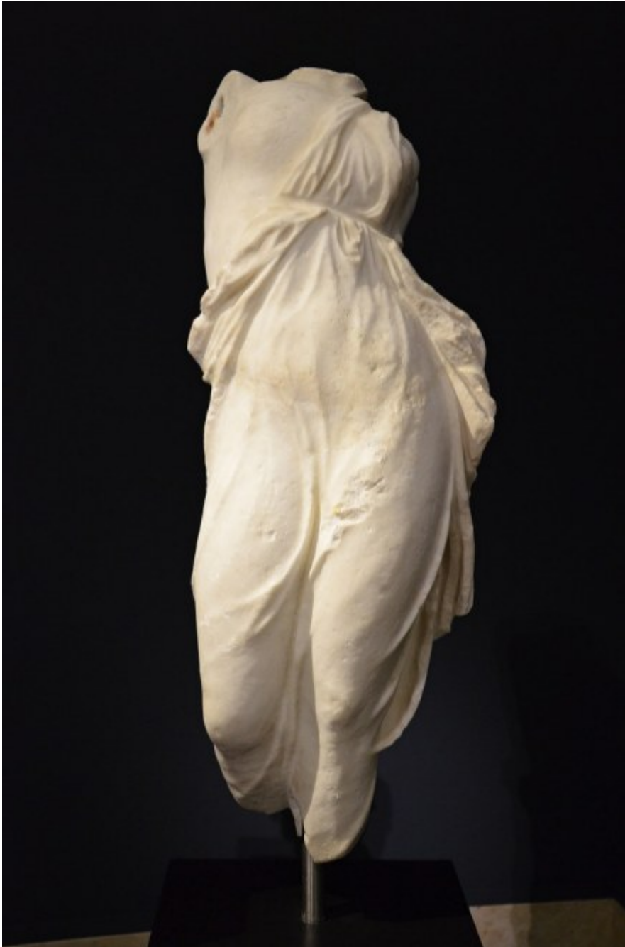
Liebieghaus, Frankfurt am Main.

Only eight fragments of Praxilla's work have survived. The longest of them is an Hymn to Adonis. In this hymn, Adonis, who is confined in Hades, is being asked by those below what he misses most from the world above. He answers: