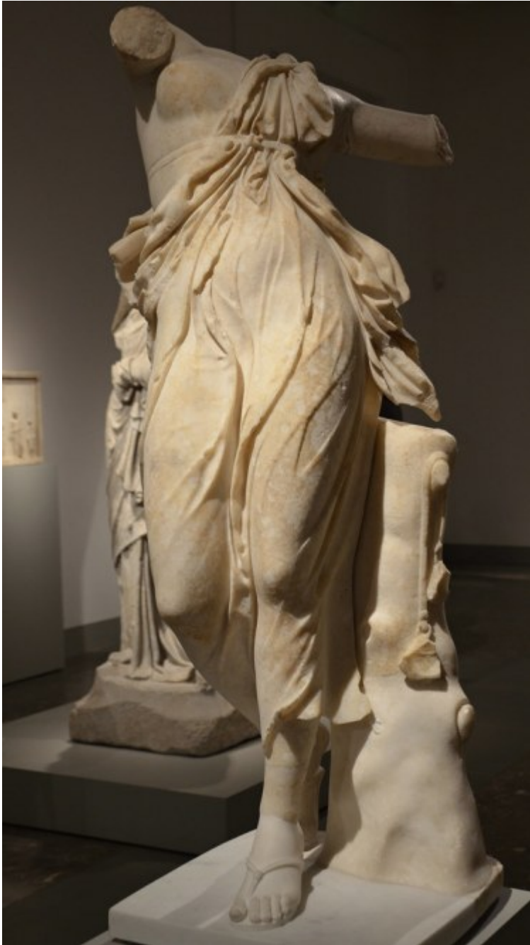
Altes Museum, Berlin.