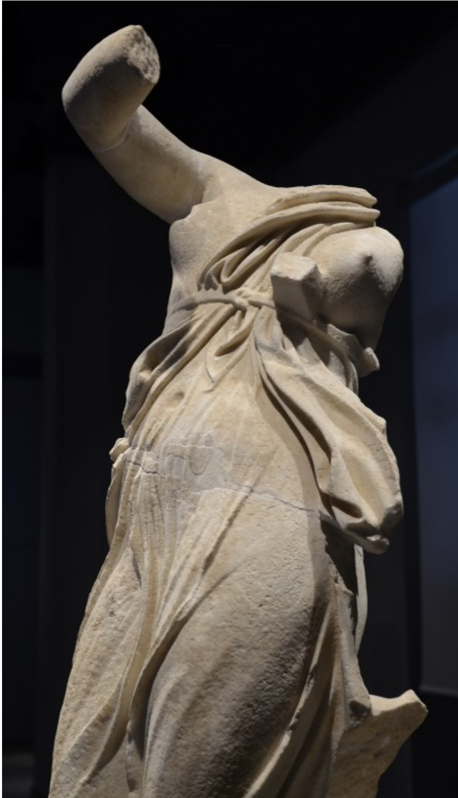
Dancing female figure, thought to be a portrait of Praxilla of