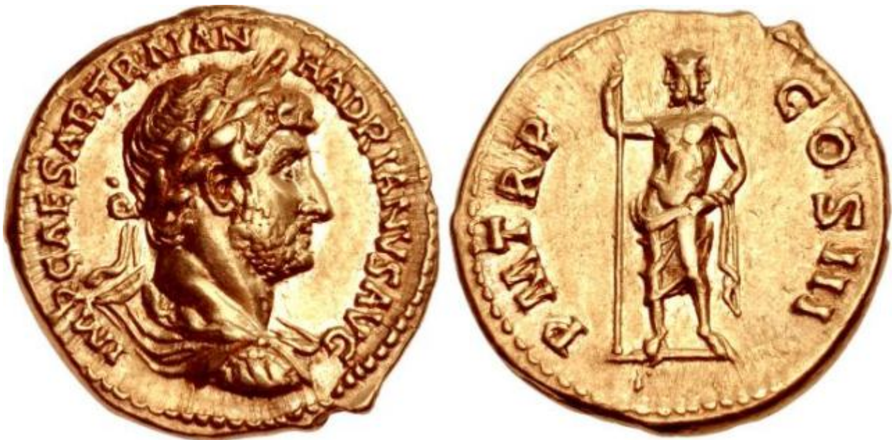
RIC II 62. Hadrian. AD 117-138. AV Aureus. Rome.

IMP CAESAR TRAIAN HADRIANVS AVG, laureate, draped, and cuirassed bust right / P M TR P COS III, Janus, standing facing, naked to waist, fold of drapery over left arm, holding sceptre in right hand.