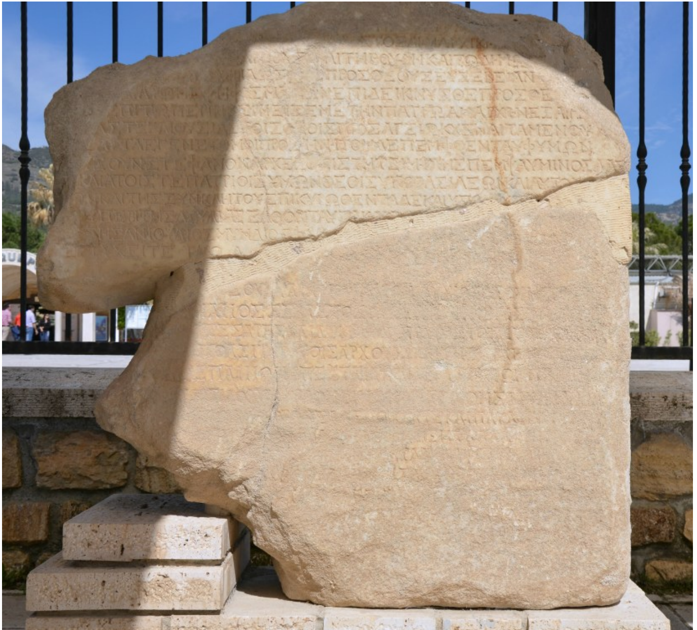
SEG 55- 1415- 1416. Hierapolis. Letters of Hadrian, AD 117/130.