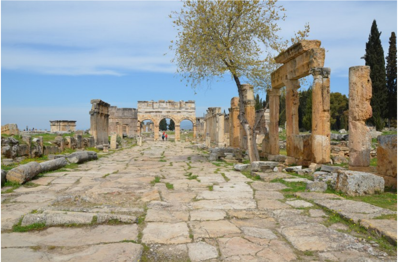
Frontinus Street extending in the north-south direction. It was the main axis of the city.

The inscription also tells us that, as a sign of generosity, the emperor renounced the city's offer of the aurum coronarium (Latin "gold for the crown"). The crown tax was a large sum of money donated by the provinces to victorious Roman generals and later to emperors upon accession. Originally it was a voluntary contribution under the Republic but later it became a mandatory tax under the Empire, collected by every new emperor and also on other occasions, as, for instance, on the adoption of Antoninus Pius. When Roman rule changed hands every two or three years in the 3rd century AD, wealthy towns felt obliged to ask for a reduction not being able to sustain the cost.