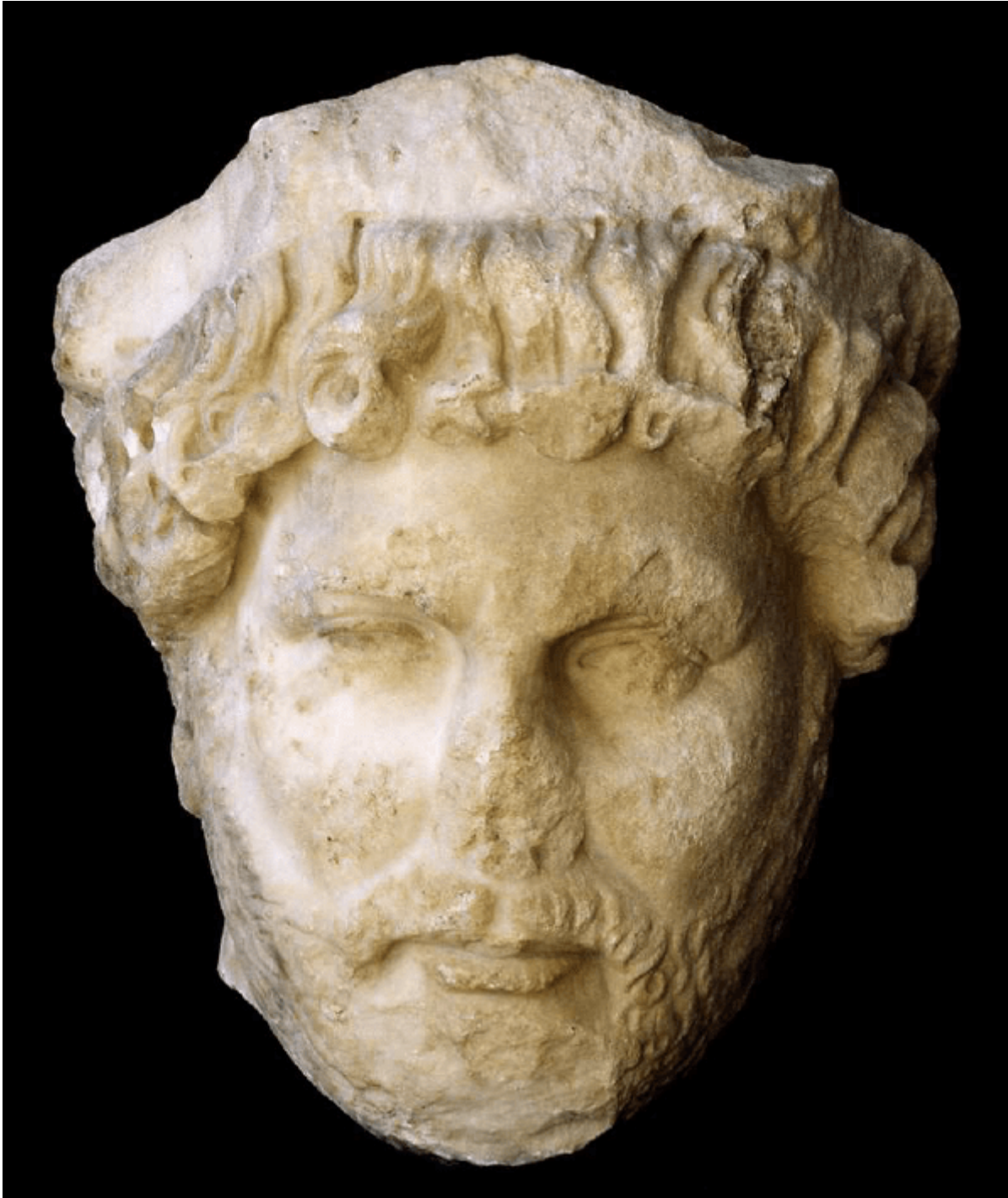
Colossal marble head of Hadrian found at Hierapolis.