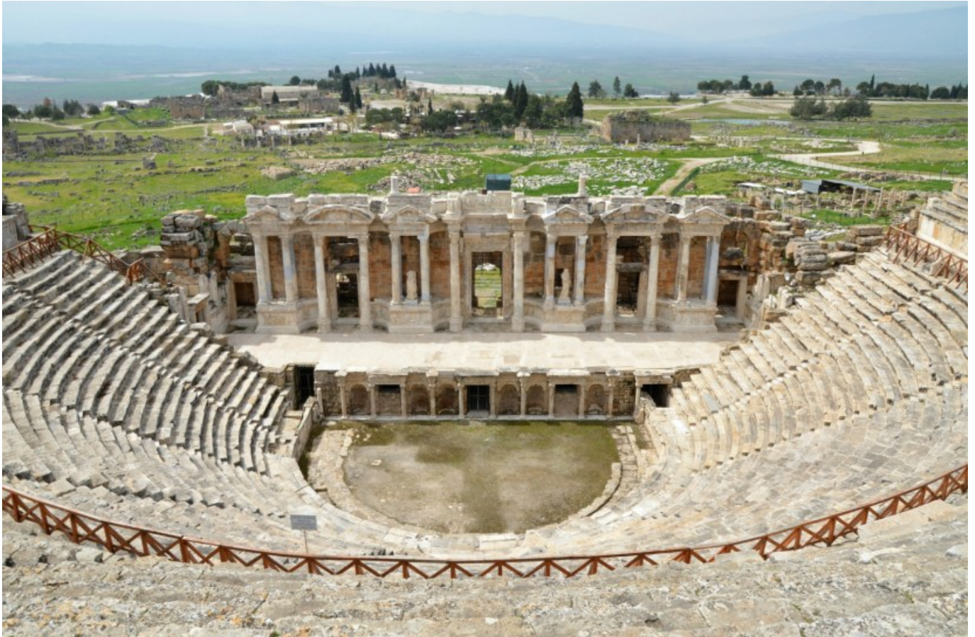
The Roman Theatre of Hierapolis, built in the 2nd century AD under the reign of Hadrian. It has been the object of important restorations between 2004 and 2014.