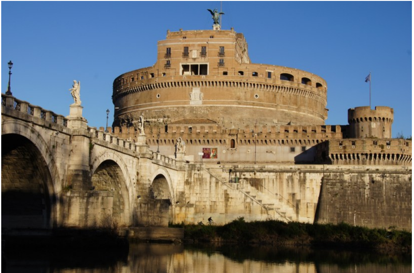
The Mausoleum of Hadrian, completed in AD 139 but since greatly modified to become a Papal fortress known as Castel Sant'Angelo, and the AD 134 Pons Aelius (now the Ponte Sant'Angelo) – Rome, Italy.