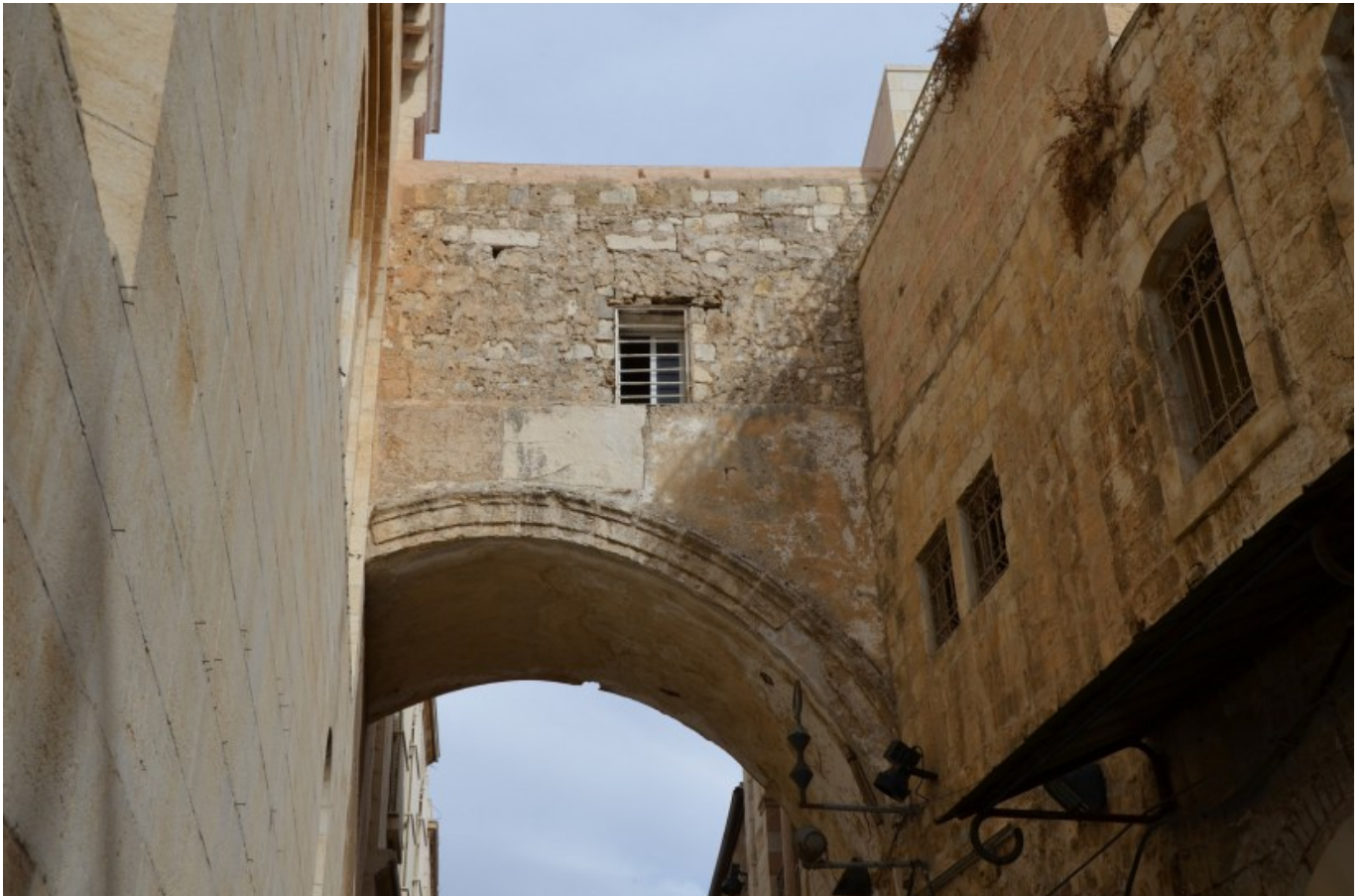
The Ecce Homo arch, a triple-arched gateway, built by Hadrian, as an entrance to the eastern Forum of Aelia Capitolina on the via Dolorosa, Jerusalem.

Hadrian was not chasing Pompey, then, but he found the triumvir anyway.