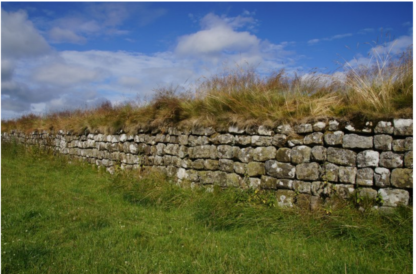
Hadrian's Wall (built AD 122) is the most famous Roman site in Britain and served as one of the

In northern Britain, Hadrian built what is - remarkably, considering the astounding beauty of the Pantheon in Rome, and the fabulous history of his own mausoleum - the most famous of his architectural projects: Hadrian's Wall. At 120 kilometres in length, the wall bisected the territory of the local Brigantes and, as with the German limes , it enabled the Romans to control movement along the wall and use it as a base for further explorations.