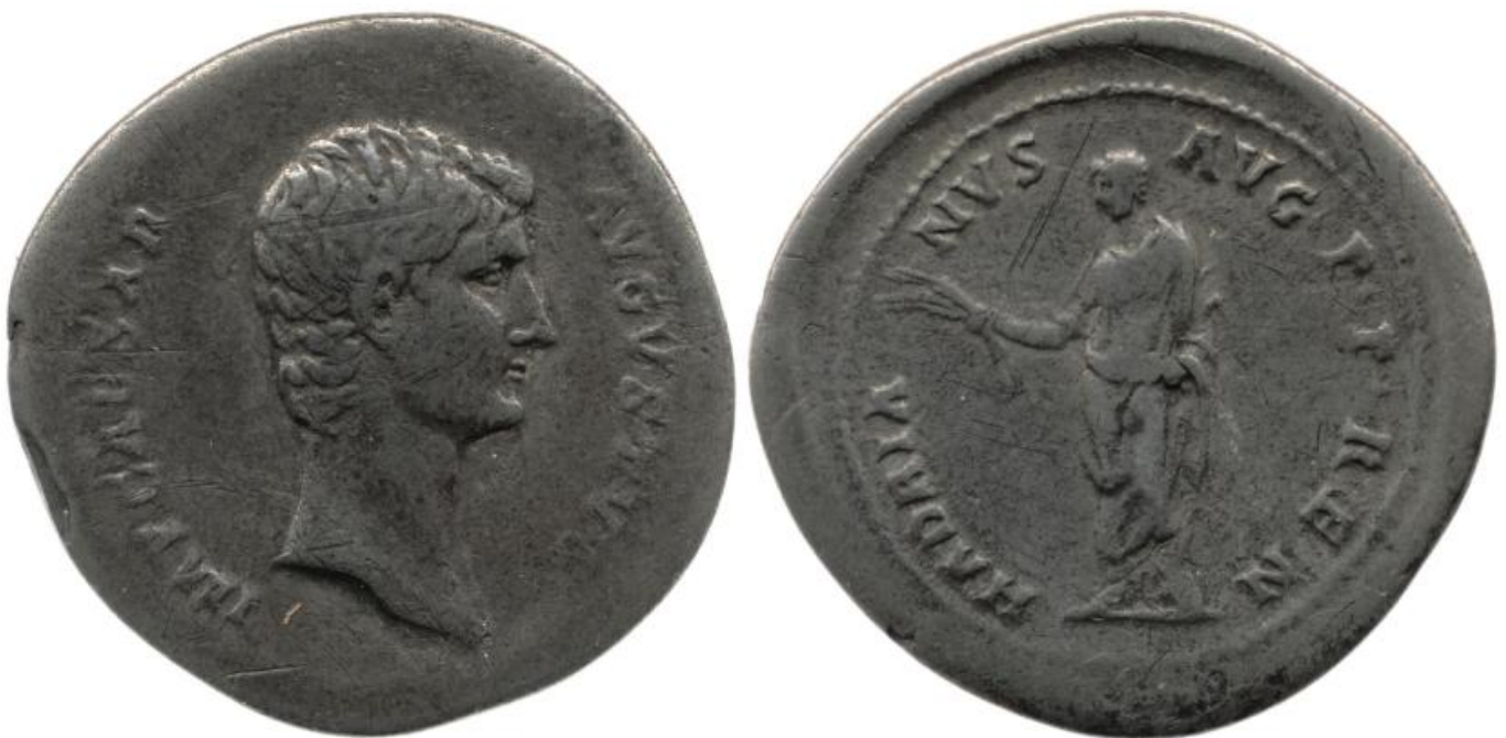
Silver coin of Hadrian with the head of Augustus on the obverse and Hadrian standing and holding corn ears on the reverse.

When Hadrian ascended to the throne following Trajan's death in 117, he immediately began trying to emulate not his just-departed relative, but Augustus himself. He rejected, for example, the title Father of the Country, 'offered to him at the time of his accession and again later on, giving as his reason the fact that Augustus had not won it until late in life'. 15 For his own imperial propaganda, he used a seal showing the head of Augustus, and he later issued a coin with his image on one side and Augustus' on the other. Suetonius wrote that he presented a bronze statuette of Augustus to Hadrian and that the emperor cherished it.