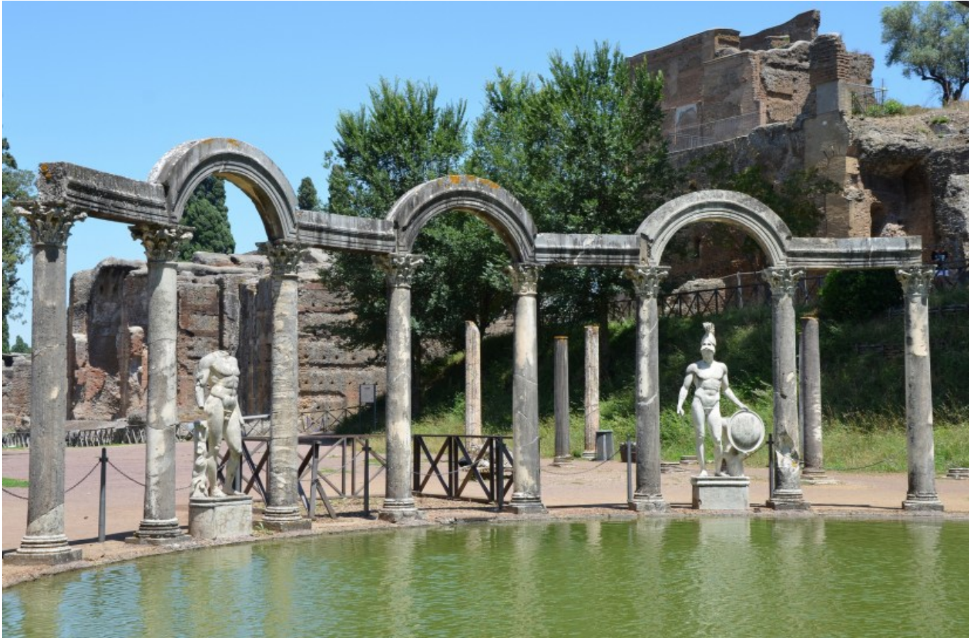
The Canopus at Hadrian's Villa in Tivoli.