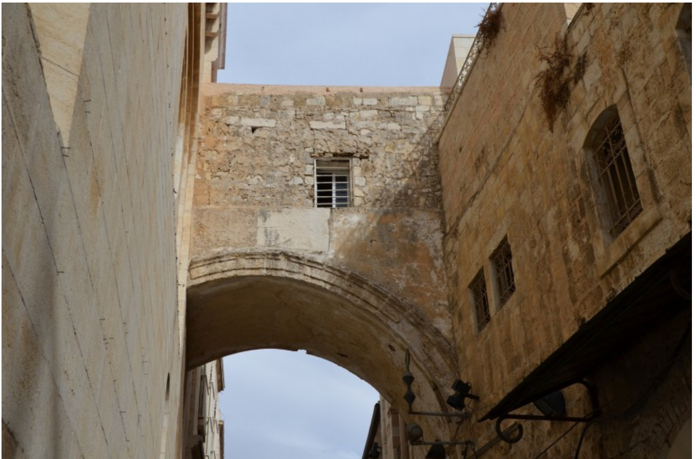
The Ecce Homo arch, a triple-arched gateway, built by Hadrian, as an entrance to the eastern Forum of Aelia Capitolina on the via Dolorosa, Jerusalem.

Hadrian was not chasing Pompey, then, but he found the triumvir anyway.