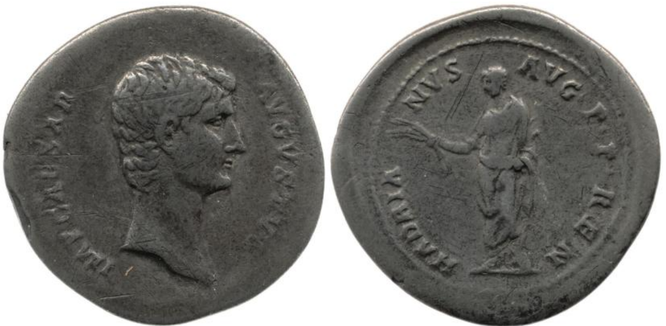
Silver coin of Hadrian with the head of Augustus on the obverse and Hadrian standing and holding corn ears on the reverse.

When Hadrian ascended to the throne following Trajan's death in 117, he immediately began trying to emulate not his just-departed relative, but Augustus himself. He rejected, for example, the title Father of the Country, 'offered to him at the time of his accession and again later on, giving as his reason the fact that Augustus had not won it until late in life'. 15 For his own imperial propaganda, he used a seal showing the head of Augustus, and he later issued a coin with his image on one side and Augustus' on the other. Suetonius wrote that he presented a bronze statuette of Augustus to Hadrian and that the emperor cherished it.