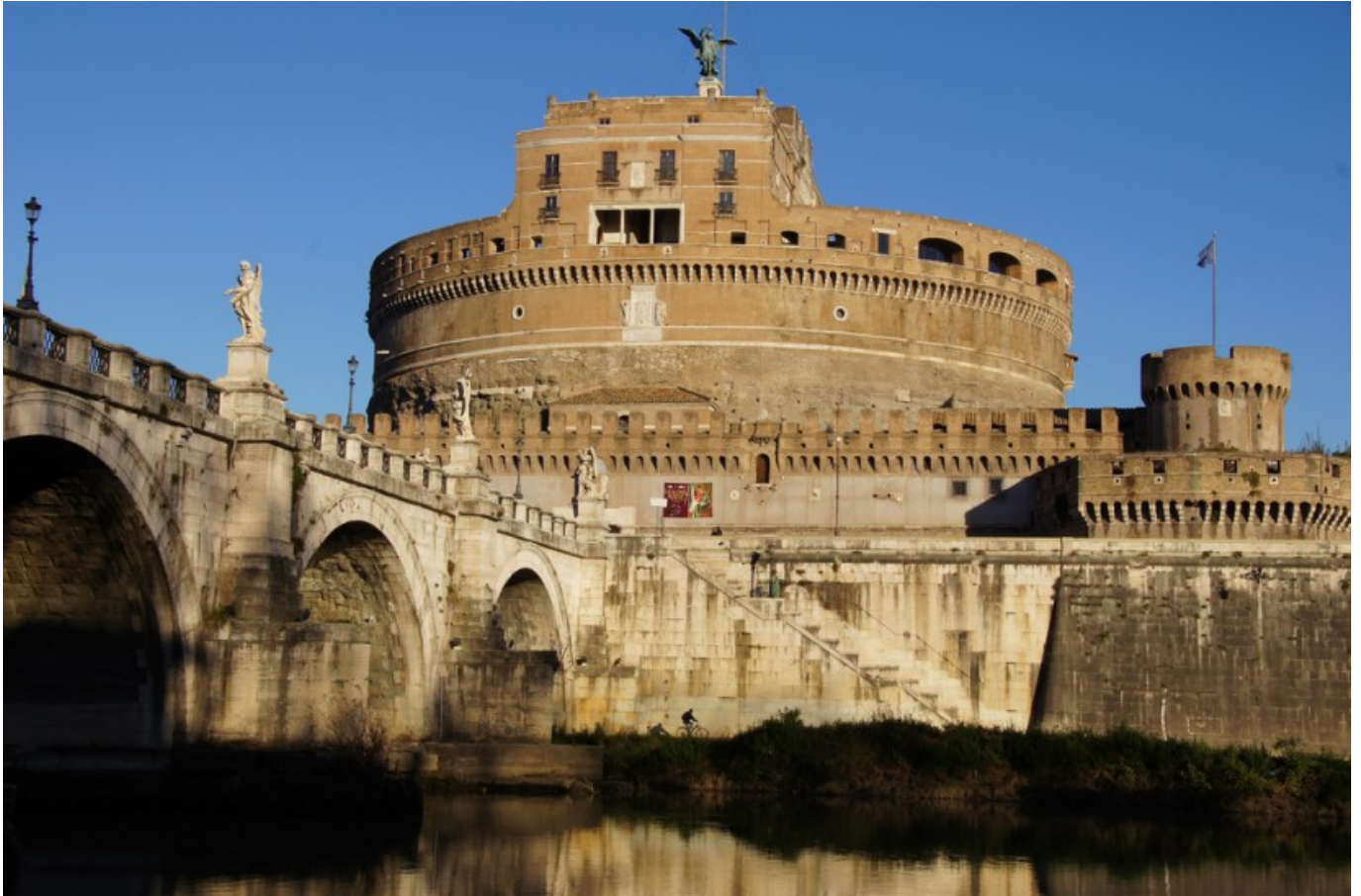
The Mausoleum of Hadrian, completed in AD 139 but since greatly modified to become a Papal fortress known as Castel Sant'Angelo, and the AD 134 Pons Aelius (now the Ponte Sant'Angelo) – Rome, Italy.