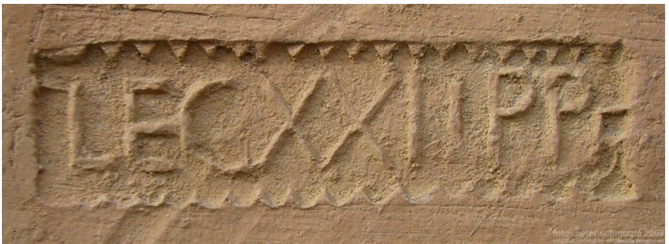
Brick stamp of the XXII Primigenia (AE 1978, 0518). Leg(io) XXII P(rimigenia) p(ia)