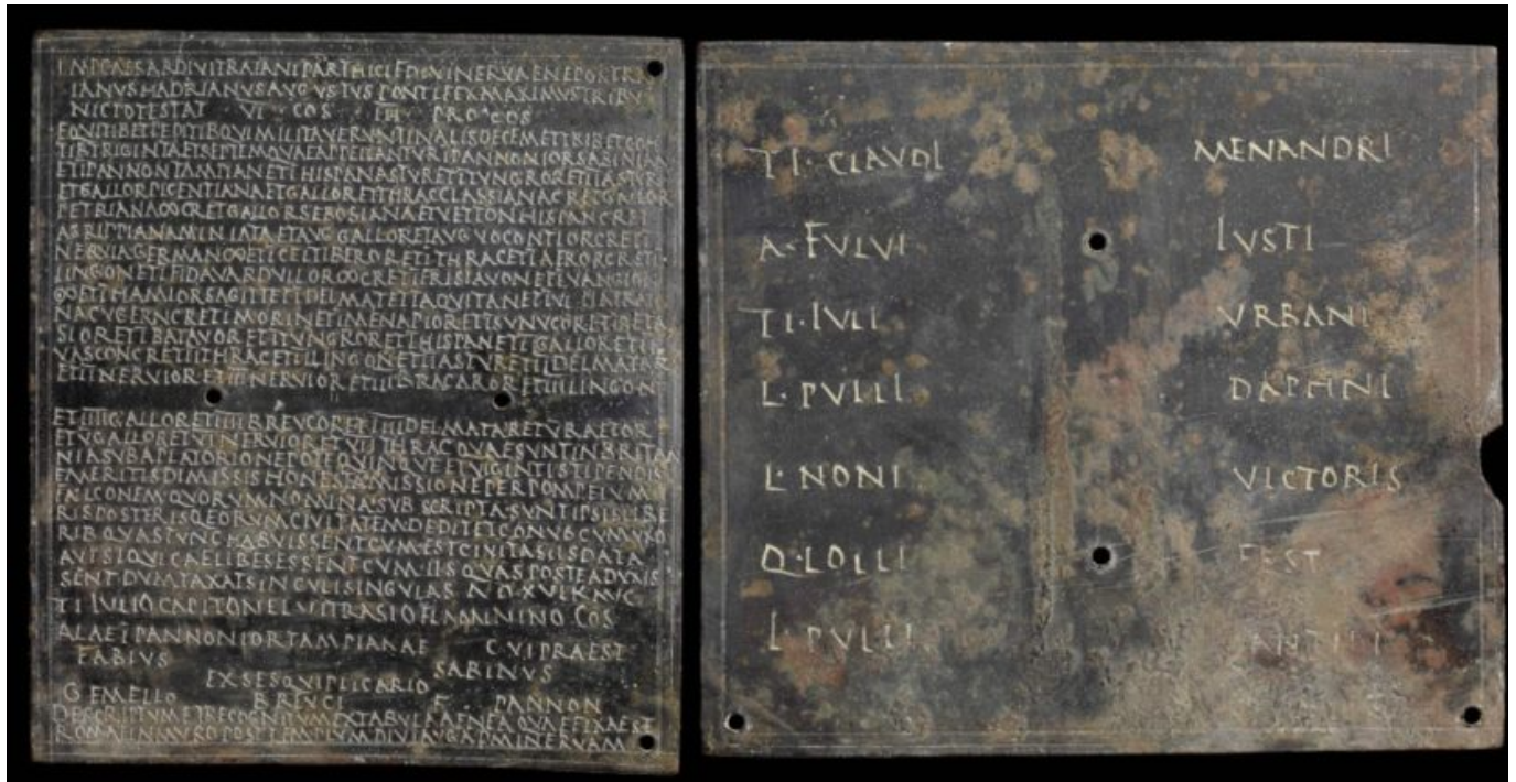
Two bronze plates formed the front and back of a four-leaved document granting citizenship to an army auxiliary named Gemellus after twenty-five years of service. It is dated July 17 AD 122.

in Britannia in 122 is also securely dated by a military diploma dated 17 July 122 ( CIL XVI 69 ). The diploma was for a veteran of the army in Britain discharged by Pompeius Falco, who had received a certificate of privileges on that date ( XVI Kalendas Augustas ).