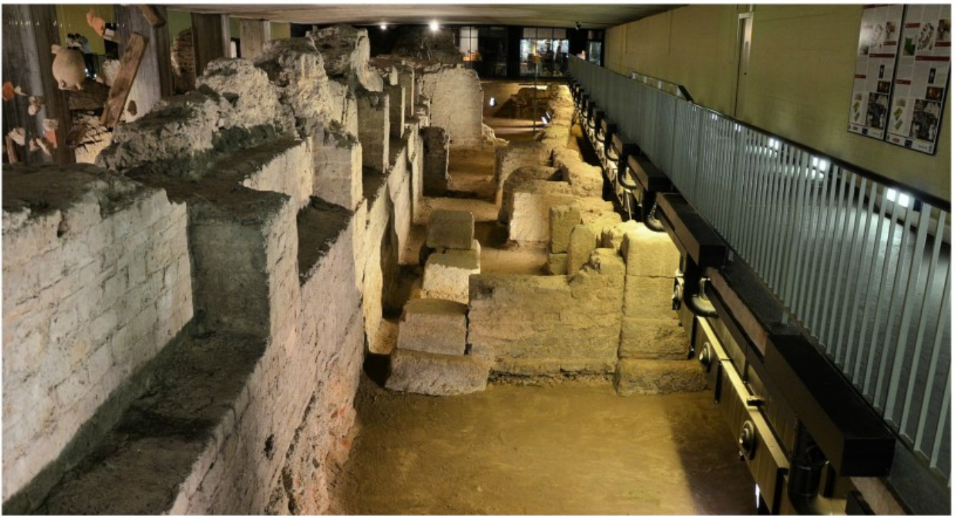
The Praetorium of Colonia Agrippinensium, the Roman Governor's Palace of Germania Superior, where Nepos lived during his governorship.

Platorius Nepos was to replace Quintus Pompeius Falco as legate of Britannia, leaving Germania Inferior with the emperor around July 122. Nepos is reported as the builder of Hadrian's Wall by the HA , and the several inscriptions found in Britain that name him (see here ) attest to this. His presence