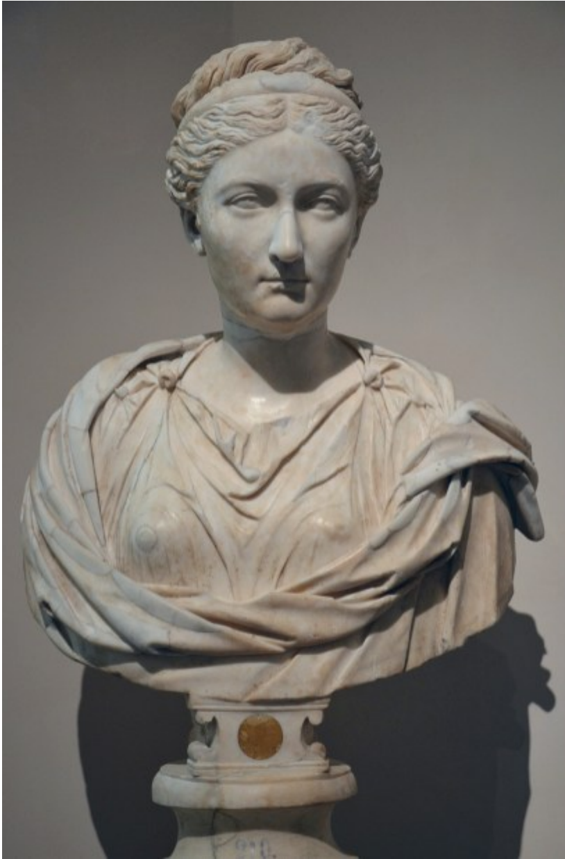
Idealised and rejuvenated portrait of empress Sabina (wife of Hadrian) with hairstyle inspired by the imagery of the goddess Diana, c. 130 AD, Museo del Prado, Madrid