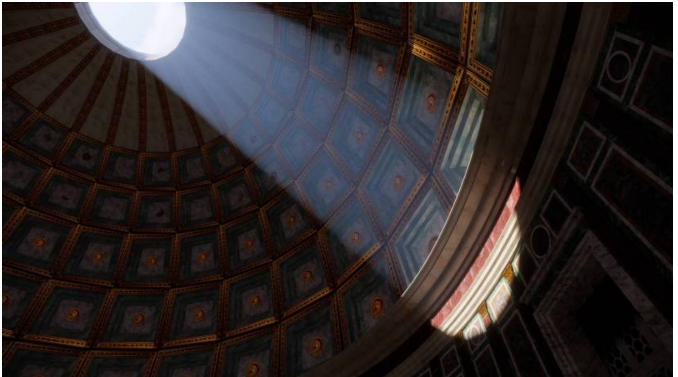
Pantheon in 3D (2011): Pantheon dome

of the 4th century AD. As a result of their work, several video clips have already been published on the History in 3D YouTube channel where one can see the recreated imperial forums, the Colosseum, Palatine, the Baths of Caracalla , the Pantheon as well as the Column of Trajan .