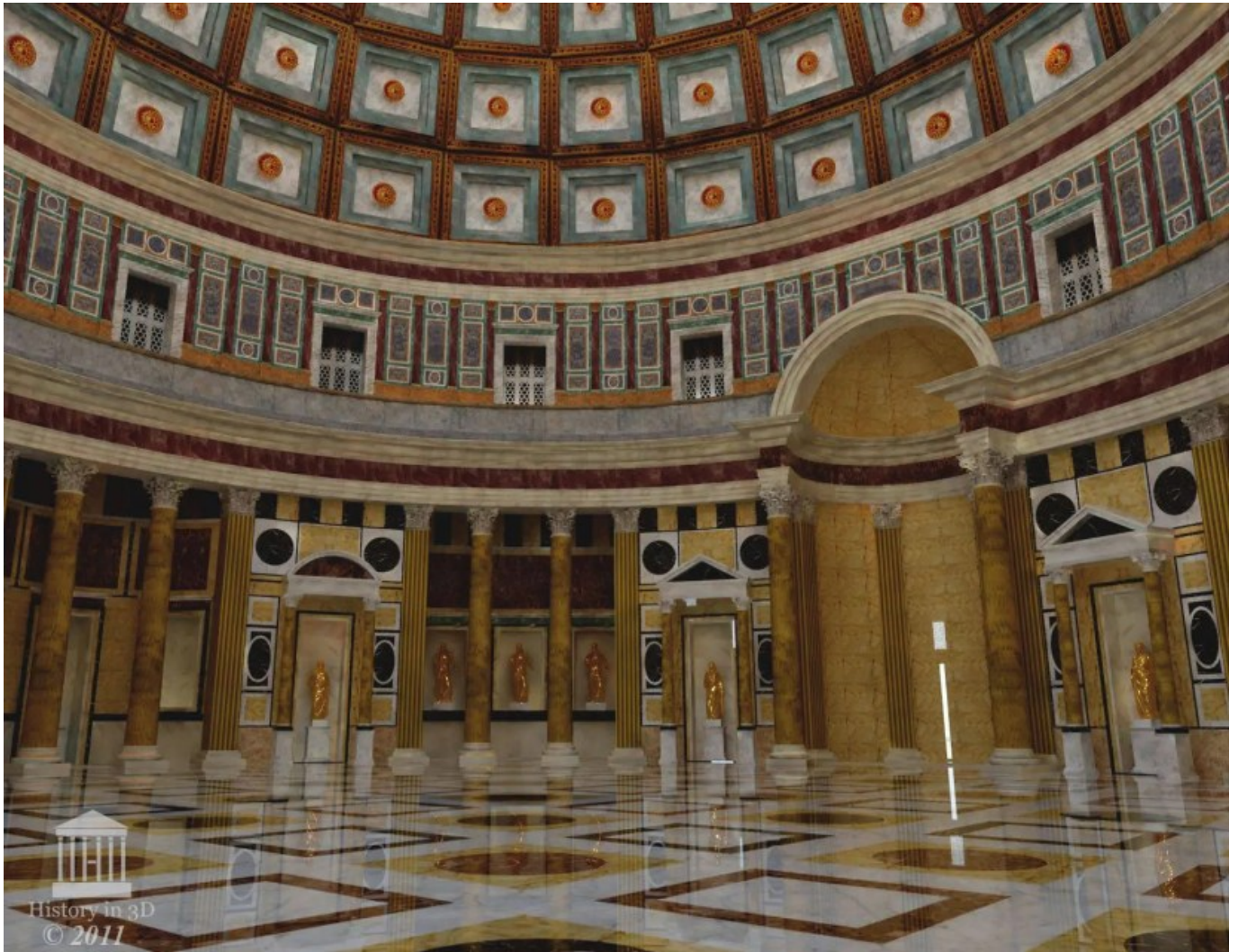
Pantheon in 3D (2011): Pantheon interior